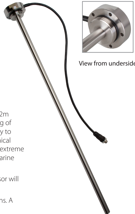
View from underside

Gill Sensors quality control ensures that every GSlevel M sensor is factory calibrated with temperature compensation to provide market leading accuracy of liquid level measurement.