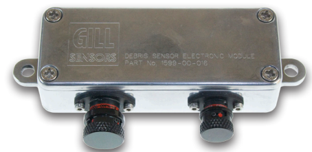
Remote Electronics Unit