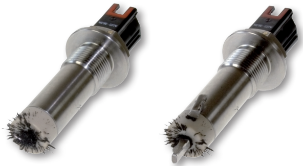
Channel 1: Fine Fine metal particle build-up

The fine channel displays the build-up of typical-use wear debris, a reliable indicator of oil cleanliness. The coarse channel is used for the detection of larger debris within the oil system, indicating possible bearing or gear damage.